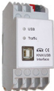
Figure 1: Photo of device

This interface is for establish a bidirectional connection between a PC and the EIB/KNX installation bus. The USB connector has a galvanic separation from the EIB/KNX bus. Both ETS (Engineering Tool Software) versions ETS3 or later and some Visualization tools support this interface.